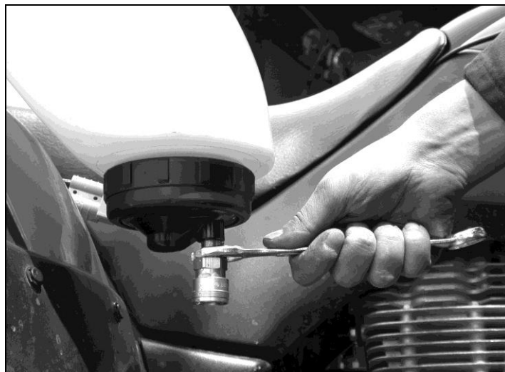
Brass quick coupler installation

If your Sprayrider™ G2 valves do not have a plug screwed into the bottom cap please contact C-Dax LTD – Freephone 0800 230 230.